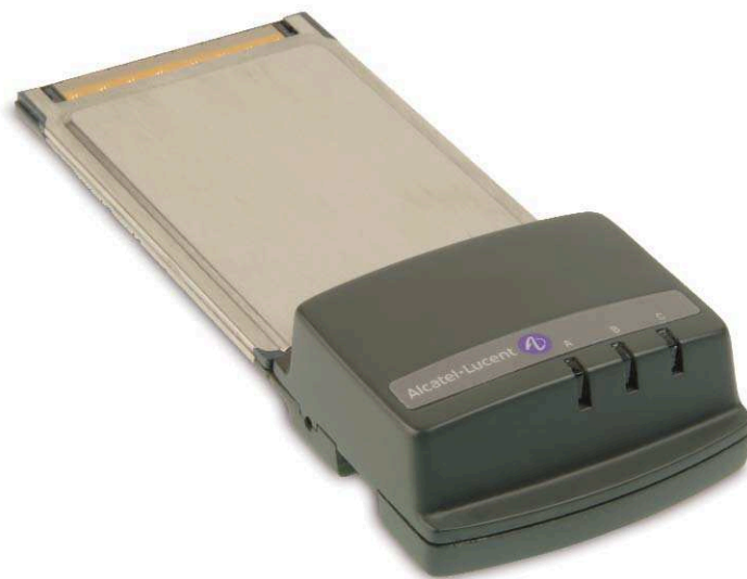
Figure 2. Card Component